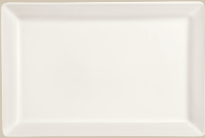
12" x 8" Rectangular Plate No. SL-26S H \frac{7}{8} 1 doz./30# • .7 cu. ft.