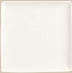
4" Square Plate No. SL-114C H \frac{1}{2} 3 doz./11# • .3 cu. ft.