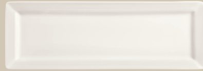
16" x 5 \frac{1}{2} " Rectangular Plate No. SL-22S H1 1 doz./31# • .6 cu. ft.