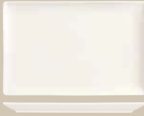
12 \frac{1}{4} " x 8" Plate No. SL-26C H \frac{3}{4} 1 doz./28# • .7 cu. ft.