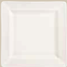
6 \frac{1}{4} " Square Plate No. SL-6S H \frac{3}{4} 3 doz./30# • .7 cu. ft.